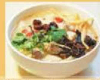
Goji Berry lamb noodles