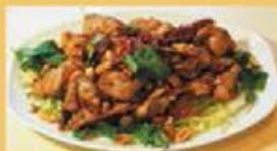
Chicken with chili