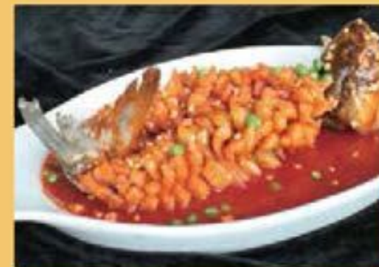
Sweet & sour blue cod