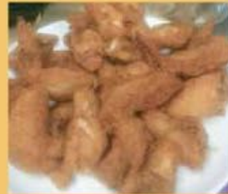
Golden chicken wings