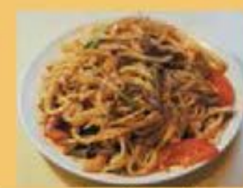
Xinjiang Lamb Fried Noodles