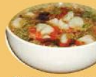
Dumpling in sour soup