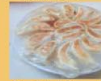
Pan Fried Dumpling