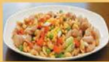
Chicken with cashews