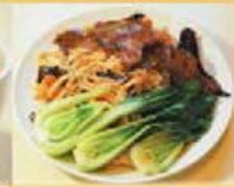
Cold beef noodles