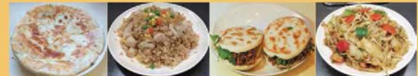
Spring onion pizza Chicken/beef/lamb fried rice Lamb burger Fried cleaver sliced noodles