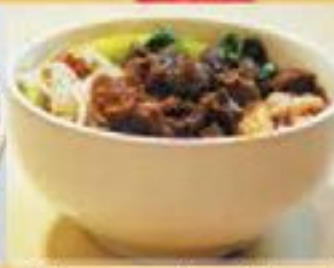
Cleaver sliced beef