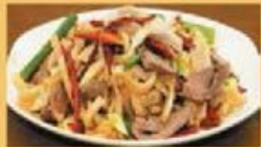
Stir-fried lamb tripe