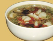
Dumpling in sour soup