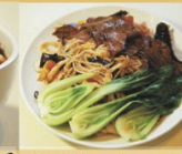
Cleaver sliced beef