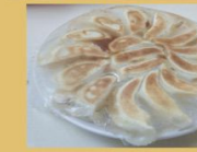
Pan Fried Dumpling