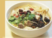
Goji Berry lamb noodles