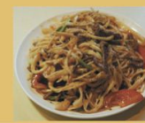
Xinjiang Lamb Fried Noodles