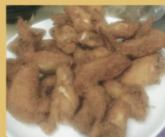
Golden chicken wings